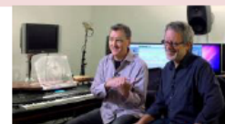
Martin O'Donnell and Michael Salvatori